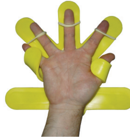
CBP with adult hand hold with elastic bands (surgical glove fingers).