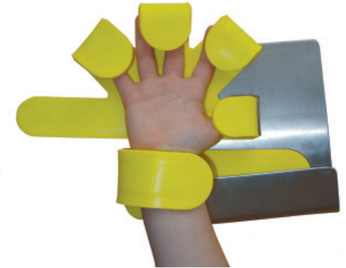
CBP with child hand with CHIROBLOC® Ballast (CBL).